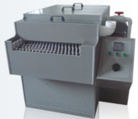
Double Surface Spraying Etching Machine