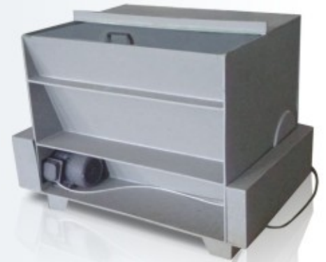
Splash Etching Machine