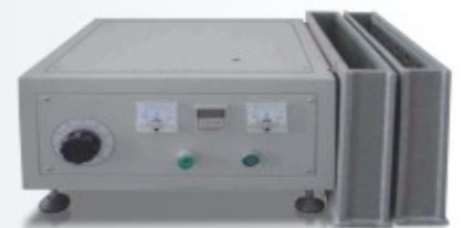
Sign Coloring Machine